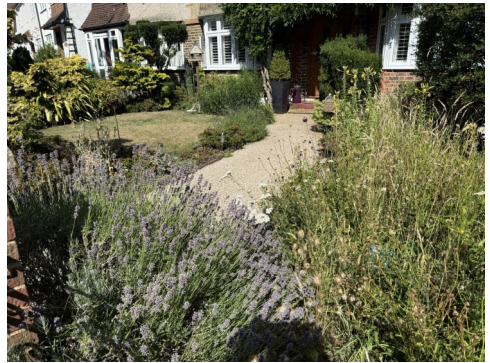
Second Place Crest Road