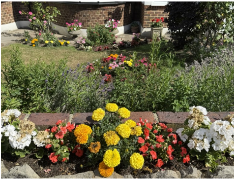
First Place Hayes Hill Road

All front gardens in Hayes are entered into the annual competition and judging took place in the first week of July when we were in the middle of a heatwave. Volunteers walked around Hayes to scout out contenders for the short list, and the Hayes Horticultural Society kindly undertook the final judging of the gardens in accordance with Royal Horticultural Society guidelines. The judges' comments were that despite the heatwave and drought conditions, which left many gardens looking overwrought and thirsty, the shortlisted gardens were of a high standard. The prize giving was held in early September at the Hayes Horticultural Society Autumn Show in the Village Hall.