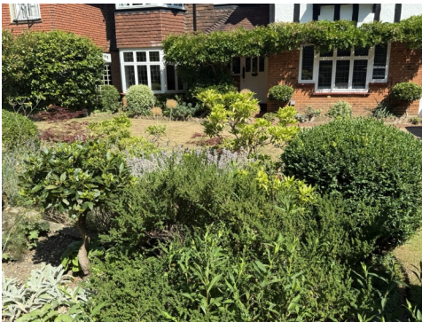
Third Place Redgate Drive

The winning garden was in Hayes Hill Road, and the residents were presented with the HVA Challenge Plate and a gift certificate. The judges liked the colourful flowers and varied planting of the garden and that it was beautifully maintained. The second placed garden in Crest Road gained marks for sustainability and eco friendliness with an innovative use of the driveway for an insect friendly wild garden. The third placed garden in Redgate Drive was more formal with mature shrubs and bee-friendly lavender. The judges also highly